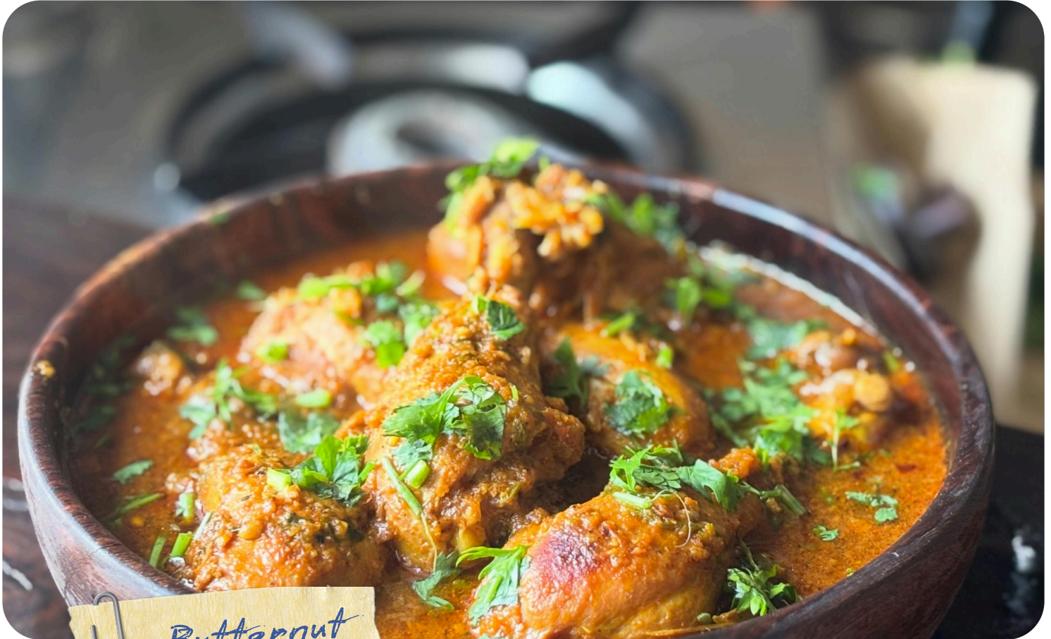
Butternut Squash Curry